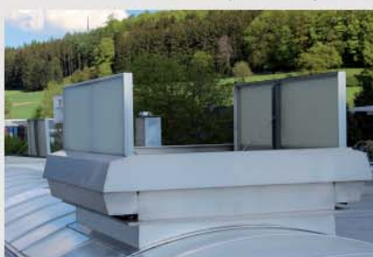
MEGAPHOENIX on a skylight