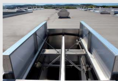
The inside of a MEGAPHOENIX