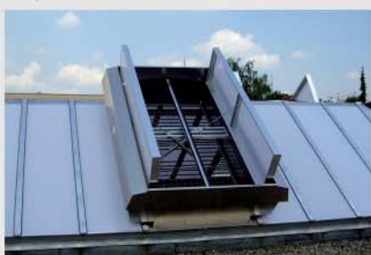
MEGAPHOENIX in a sloped roof