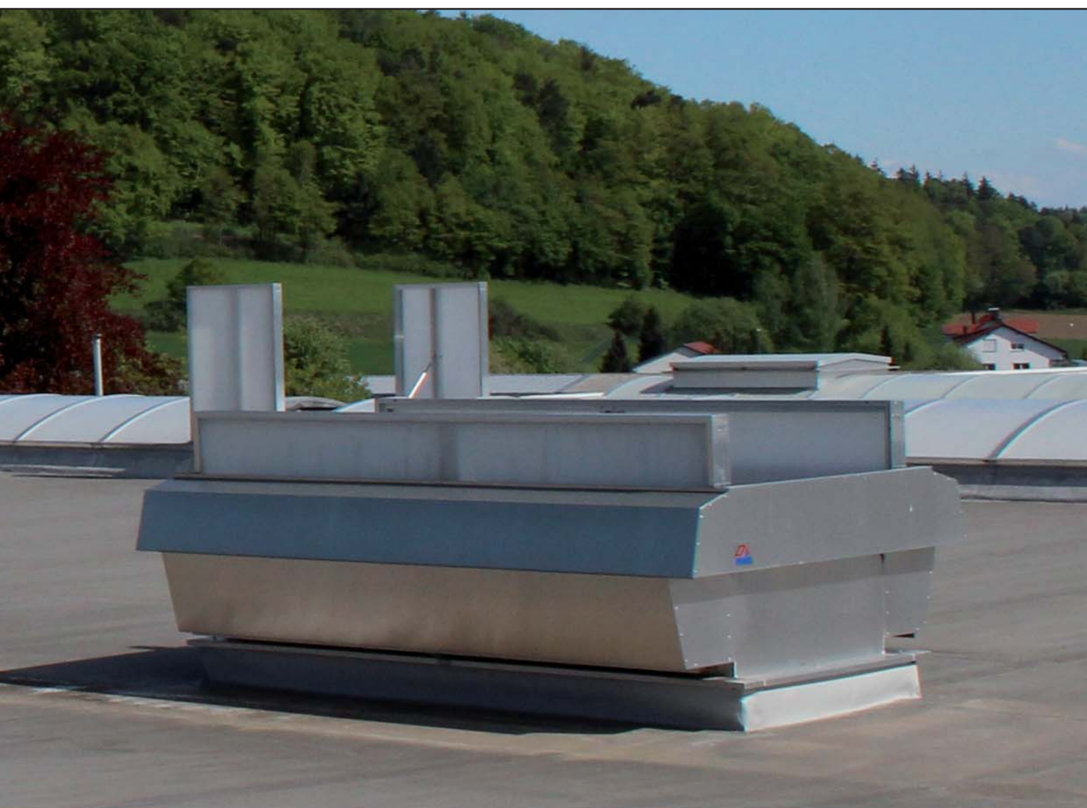
Large illustration: MEGAPHOENIX as a stand-alone unit on a factory building.