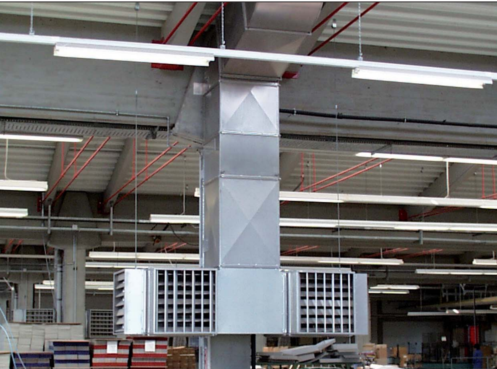
Large illustration: Mechanical ventilation system type AIRSTAR with manually adjustable ventilation grille.