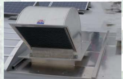
Roof-mounted suction hood